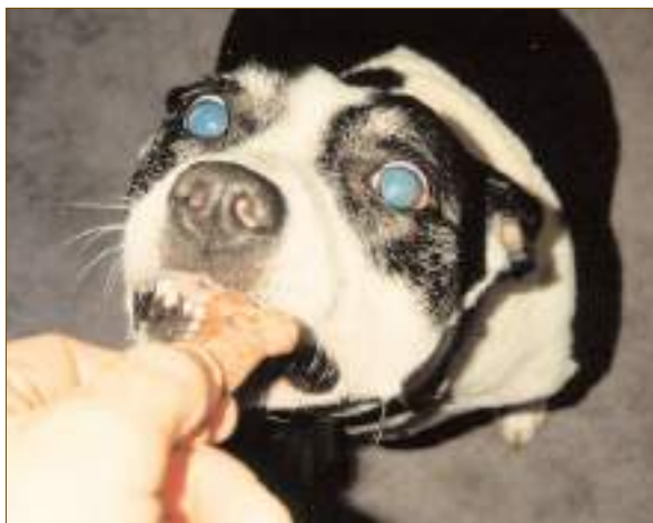
Green-eyed cookie monster

When played intelligently, physical games, such as play-fighting and tug-of-war, are effective bite inhibition and control exercises, and are wonderful for motivating adult dogs