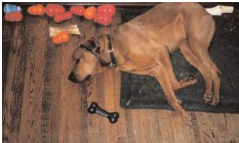
Claude Konged—peacefully passing the time when left at home alone (after chewing himself to sleep)

Give your puppy plenty of toys whenever leaving him on his own. Ideal chewtoys are indestructible and hollow (such as Kong products or sterilized longbones), as they may be