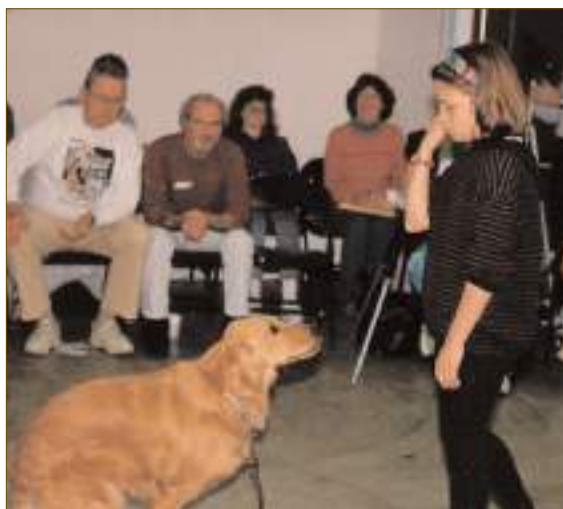
By coming when called and sitting on request, a puppy demonstrates willing compliance and shows respect to his trainer—a child.

Give children tasty treats such as freeze-dried liver as well as kibble to use as lures and rewards during handling and