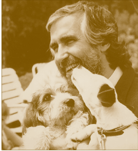
Puppy cuddle time.

Many adult dogs are more fearful of men than they are of women. So invite over as many men as possible to handle and gentle your puppy. It is especially important to invite men to socialize with your puppy if no men are living in the household. Make sure you teach all male visitors how to handfeed kibble to lure/reward your pup to come, sit, lie down, and roll over. Add a few extra tasty treats to each male visitor's bag of training kibble so that your puppy forms a fond and loving bond with men.