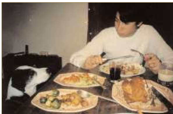
Teaching "Off" has many useful applications.

Basically, you have to teach your puppy that voluntarily relinquishing an object does not mean losing it for good. Your puppy should learn that giving up bones, toys, and tissues means receiving something better in return—praise and treats—and also later getting back the original object.