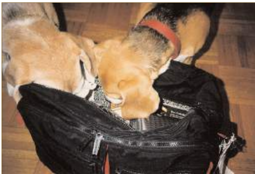
Beagles just begging to "unpack" a visitor's unattended luggage

Most doggy "disobedience" and wanton house destruction occurring in the owner's absence has nothing to do with separation anxiety. In fact, separation relief might be a more precise and descriptive term. The dog chews, digs, barks, and soils the house only when the owner is absent because he has learned it would be foolhardy to indulge in these pastimes when the owner is present. Owner-absent misbehavior is an indication that the owner has tried to suppress normal and natural dog behaviors with punishment, rather than teaching the dog how to behave—namely, how to express his basic doggy desires in an acceptable fashion. Often the term separation anxiety is an excuse for a dog who is simply not yet housetrained or chewtoy-trained.