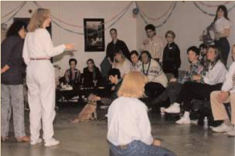
Not a bad start: eighteen people to meet one three-month-old puppy

Capitalize on the time your pup needs to be confined indoors by inviting people to your home. Your pup needs to socialize with at least a hundred different people before he is three months old. I know this may sound like a bit of an ordeal, but it is