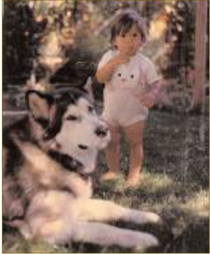
Children and puppies (or dogs) should never be left together unsupervised.

First, invite over only well-trained children. Supervise the children at all times. I repeat, supervise the children at all times. (Later on, puppy classes will offer a wonderful source of