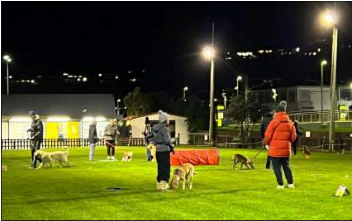
A crisp, cool evening of Domestic training at TBCOC